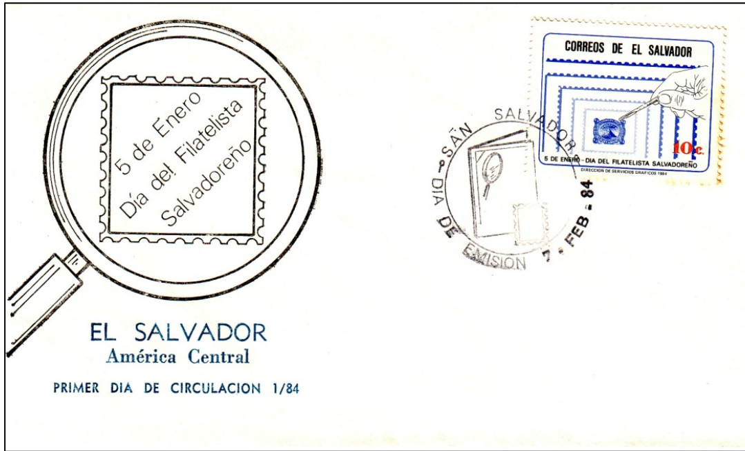
First Day Cover of the Salvadorian Philatelist Day

honor of the Salvadorian Philatelist Day, January 5, which is the actual day of the creation of the Society. The stamp depicted the 1867 ½ Real stamp held by a stamp tong.