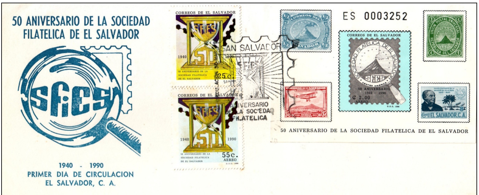
FDC of the 1990 50 th Anniversary of the Salvadorian Philatelic Society issue

the 1989 Promotion of Philately issue) surrounded by four classic Salvadorian stamps: the 1867 ½ Real (first stamp issued by El Salvador), the 1879 1c stamp (first stamp printed in El Salvador), the 1931 15c Air Mail stamp, and the 1940 8c stamp commemorating the Centenary of the Penny Black.