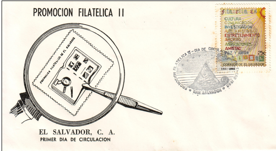
FDC of the 1988 Promotion of Philately issue depicting the Salvadorian coat of arms and several benefits of Philately.

According to the accompanying philatelic bulletin, the Salvadorian Postal Service considered that philately was a “bearer of a message from the people of the world to its contemporaries and a historical heritage for the future,” and that the postage stamp had “great importance in the cultural, social and economic