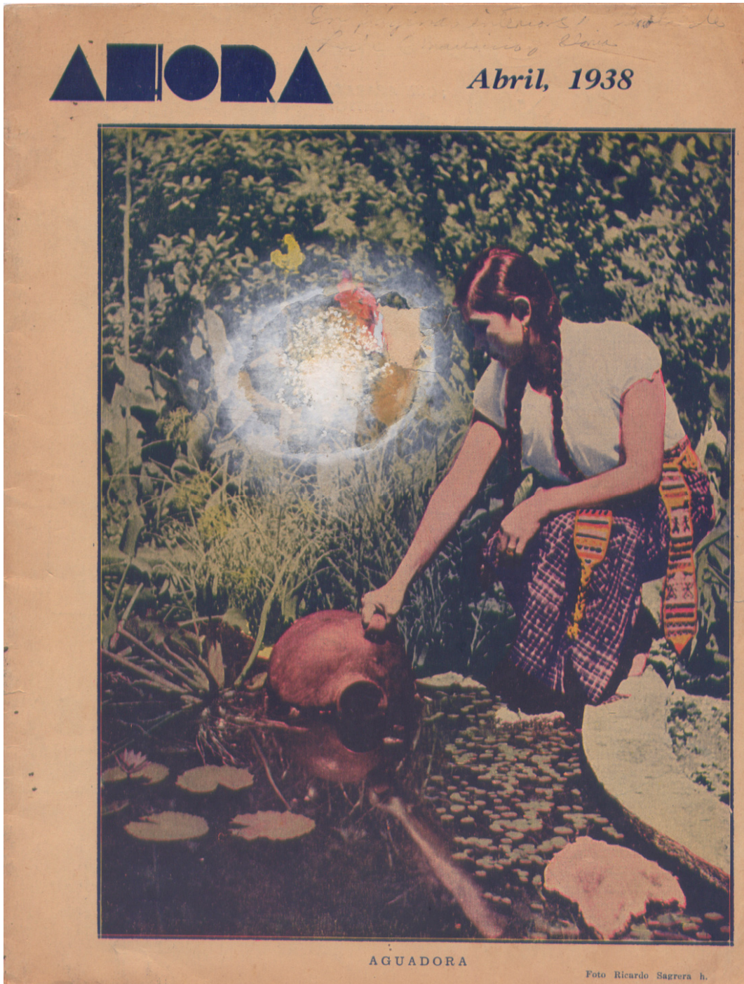
April 1938 issue of the magazine Ahora with the “Aguadora” on its cover

1896 24c Atehuasillas Fall, which was most probably taken from the Elemental Geography of the Republic of Salvador published in 1890, and which is shown on the following page.