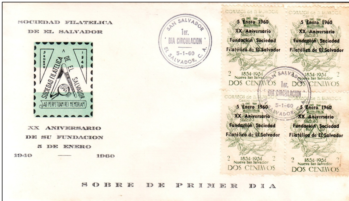
First Day Cover of the issue commemorating the 20th Anniversary of the Salvadorian Philatelic Society (1960).