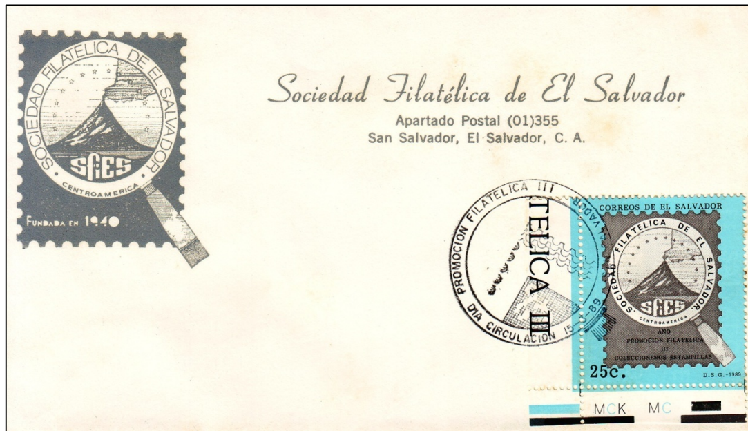
FDC of the 1989 Promotion of Philately issue with the Society's logo

ambits of a Nation”. As such, and in consideration of the growing importance of philately in the country, it thought important to issue these stamps as an additional incentive for local and international collectors and to complement its basic objectives of communication, service and culture.