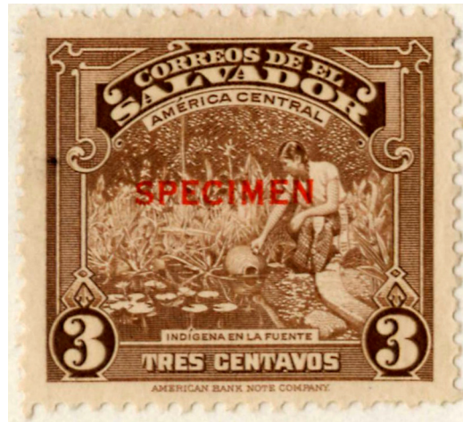
Photographic Model of the 1938 3c stamp (left); Specimen of the same stamp (right)

Although we devote our free time to the study of stamps, their varieties and the postal history associated with them, only seldom do we have the chance to actually see with our own eyes where the design of a particular stamp actually comes from and how it evolved into the final perforated piece of paper that we treasure in our collections.