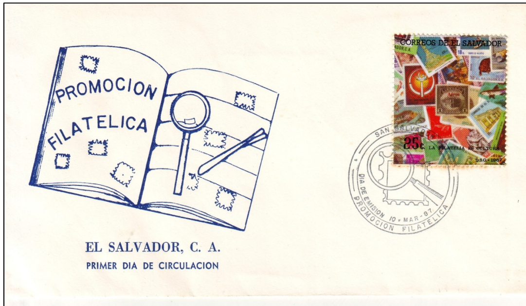
FDC of the 1987 Promotion of Philately issue with a collage of Salvadorian stamps

philately were issued in 1987, 1988 and 1999.