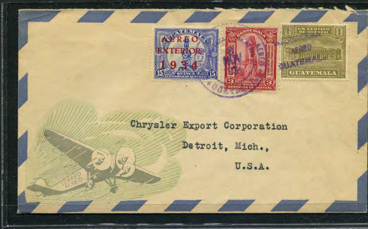
1934. Air Mail Cover. Tied with Sc. #C28 (15c), #258 (3c), plus RA2 (1c) Postal Tax Stamp. Guatemala City to Detroit, Michigan.