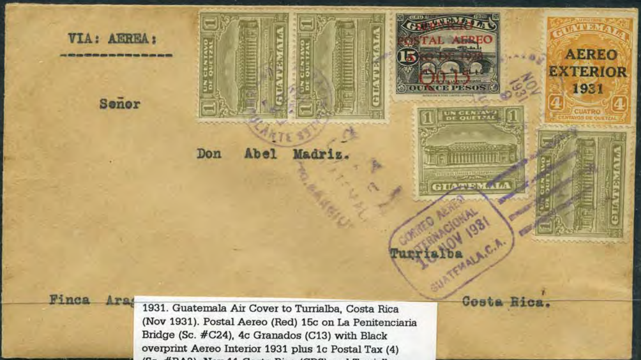
1931. Guatemala Air Cover to Turrialba, Costa Rica (Nov 1931). Postal Aereo (Red) 15c on La Penitenciaría Bridge (Sc. #C24), 4c Granados (C13) with Black overprint Aereo Interior 1931 plus 1c Postal Tax (4) (Sc. #RA2). Nov 11 Costa Rica (CDS) and Turrialba Nov 12 receiving mark (CDS) on reverse.