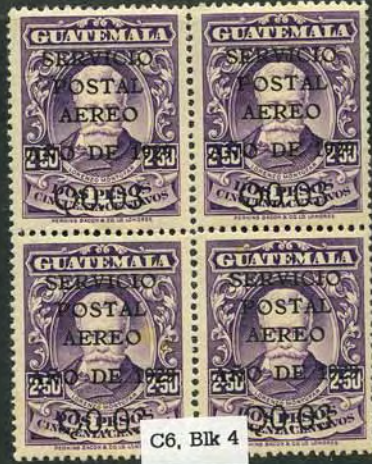
C6, Blk 4

1929. Sc. #C6, ISGC #362. 3c on 2.50 purple. Typographed "SERVICIO POSTAL AEREO ANO DE 1929 Q0.03 in black by the Tipografia Nacional on 25,000 copies of the regular 2.50p of 1924. Issued on October 9, 1929. Surcharge measures 19 1/4 by 21 1/2 mm. Setting covers the entire sheet of 100.