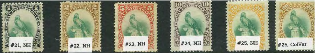
1881. Sc. #21-25. ISGC #22-26. Small Quetzal Issue of 1881. Recess engraved and printed by the American Bank Note Co., New York. Unwatermarked white paper, Perf. 12. Placed on sale November 7, 1881. Design measures 20 1/4 by 25 1/2 mm.