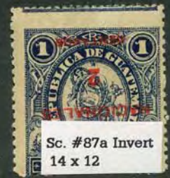
Sc. #87a Invert 14 x 12

1898. Sc. #86-87, ISGC #92-97. Provisionals on Lithographed Revenue Stamps. Typographed in red on the revenue stamps of 1895, lithographed by Payot, Upham & Co. of San Francisco. Perf. 12 (#92) 1c dark blue, (#93) 2c on 1c dark blue; Perf. 12x14, (#94) 1c dark blue, (#95) 2c on 1c dark blue; Perf. 14x12 (#96) 1c dark blue, (#97) 2c on 1c dark blue.