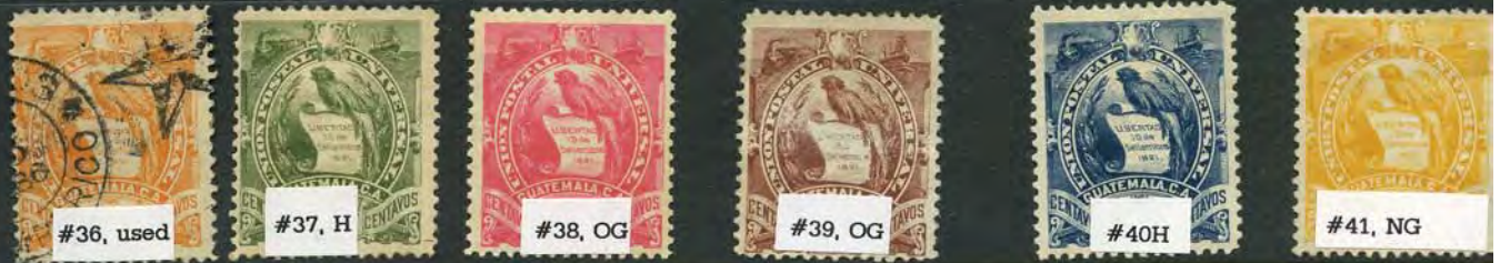
1886. Sc. #31-41. ISGC #32-42. 1c-200c. Regular Issue of 1886. Lithographed by the American Bank Note Co., New York (margin only) on unwatermarked paper, Perf. 12. Dull impression when compared to the engraved stamps and the lines at the Upper Left are equal in size.