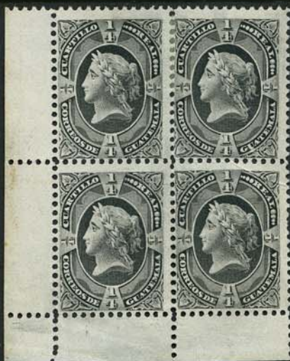
1875. Sc. #7, ISGC #7. 1/4R. Lower Left Corner Block with full margins. Ink stain on selvege. Perf. 12, H.