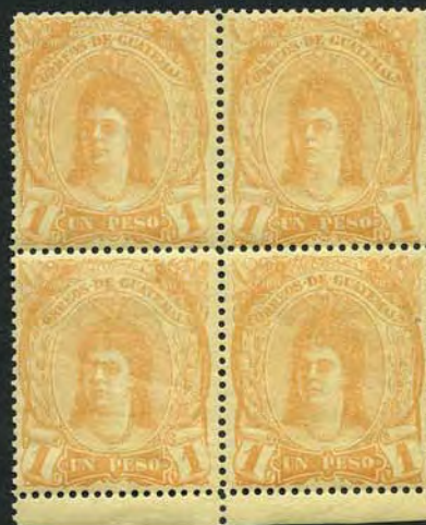
1878. Sc. #14, ISGC #14. Block of 1p Indian Woman with "B" margin. Part watermark visible. H.