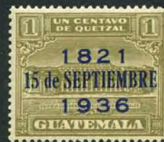
1936. Sc. #RA4. 1c olive green. RA2 Overprinted in Blue "1821 15 de SEPTIEMBRE 1936."