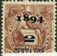
#52a(11 mm), NH