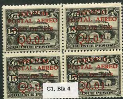
C1, Blk 4