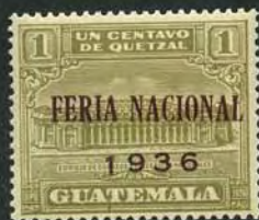
1936. Sc. #RA5. 1c olive green. RA2 Overprinted "FERIA NACIONAL 1936."