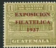
1937. Sc. #RA6. 1c olive green. RA2 Overprinted in Red "EXPOSICION FILATELICA 1937."