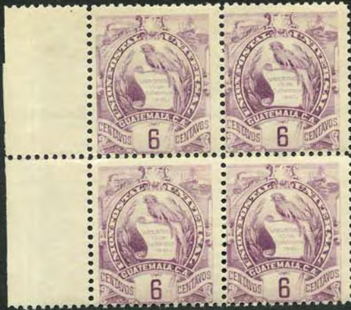
1895. Sc. #46. ISGC #50. Mint Block of 4. NH