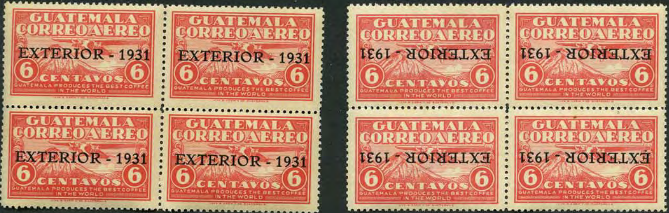
1931. Sc. #C14. ISGC #380. Typographed. "Exterior - 1931" Overprint in Black on 6c Air Post. Block of 4. Regular and Inverted Overprint.