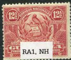
1919. Sc. #RA1. 12 1/2c carmine. National Emblem. Postal Tax Stamps.