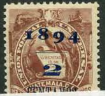
#52(14 1/2mm), NH