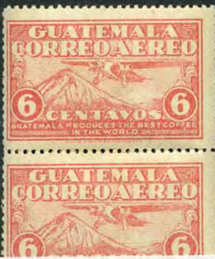
Sc. #C7, (Vert. Pair - Light Impression)

1929. Sc. #C6, ISGC #362. 3c on 2.50 purple. Typographed "SERVICIO POSTAL AEREO ANO DE 1929 Q0.03 in black by the Tipografia Nacional on 25,000 copies of the regular 2.50p of 1924. Issued on October 9, 1929. Surcharge measures 19 1/4 by 21 1/2 mm. Setting covers the entire sheet of 100.