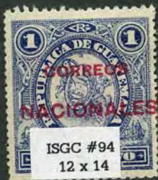
ISGC #94 12 x 14