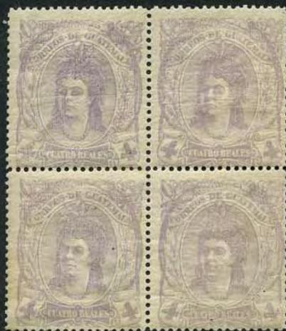
1878. Sc. #13, ISGC #13. 4r Indian Woman, Block of 4, Light Shade. NH.