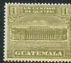
1927. Sc. #RA2. 1c olive green. G.P.O. and Telegraph Building. Typo. Perf. 14.