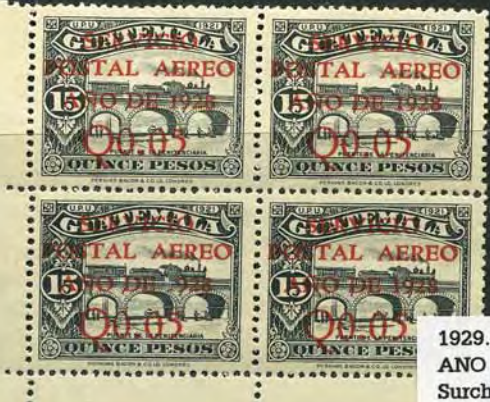
C5, LLCorner Blk

1929. Sc. #C5, ISGN #359. Typographed "SERVICIO POSTAL AEREO ANO DE - 1928 Q0.05" in red. "1921" in top frame (P.O. error). Surcharge measures 24 3/4 by 17 3/4 mm. Printed in sheets of 50 and issued on May 20, 1929. 55,000 surcharged, 46,000 destroyed, 9,000 sold.