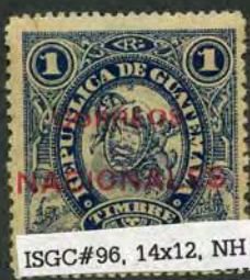
ISGC#96, 14x12, NH