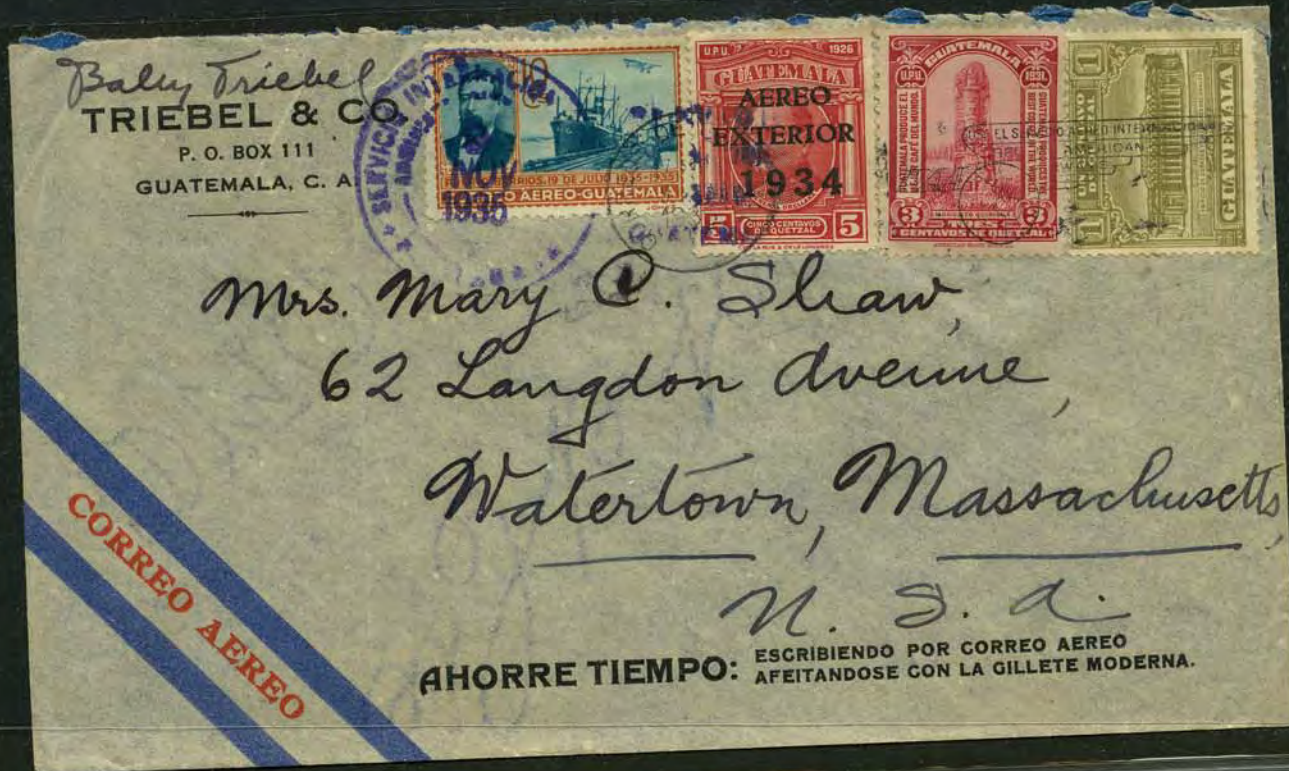
1935. Air Post Cover Guatemala City to Watertown, Mass. Tied with Sc. #C29 (10c); C26 (5c); #258 (3c); plus RA2 Postal Tax (1c) = 18c + 1c tax rate.