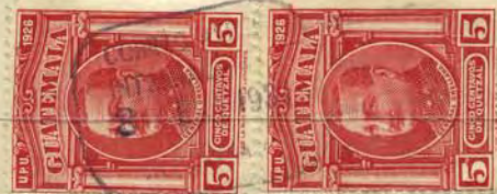
1931. Air Mail Cover. Guatemala City to San Francisco. Tied by Sc. #238 (General Orellana) (3) = 15c, plus Sc. #238 (Montufar) (1) = 3c, plus 1c Postal Tax stamp Sc. #RA2. (18c + 1c tax rate).

Standard Brands Incorporated of California 245 Eleventh Street San Francisco, California U. S. A.