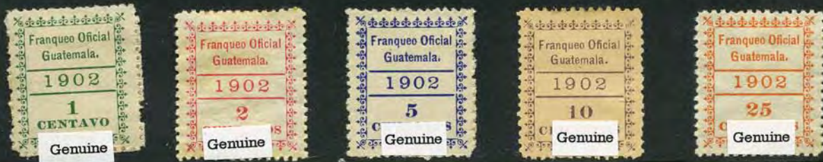
1902. Sc. #O1-O5, ISGC #139-143. Group A. 1c-25c. Typographed by Sanchez y de Guise, Guatemala City, in sheets of 100, arranged 10 by 10, and perforated 11.9. Put into use December 18, 1902, for franking official mail to foreign addresses. Designs measure 21 by 25 mm. On thin paper with transparent gum. Watermarked "AMERICAN LINEN BOND."