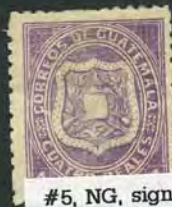
#5, NG, signed

1871 Coat of Arms Regular Issue. Genuine: These finely-engraved stamps feature six-and-a-half thick, white vertical bars in the upper portion of the shield with the half-bar located in its upper-left corner. The half-bar gradually tapers downward to a fine point that joins the left frame of the shield. Unused examples are relatively common, but used ones with genuine cancels are scarce. Faked cancels are frequent, so expertization of used examples are recommended. Forgery: Of all the forgeries, the ones prepared by the Spiro Brothers in Hamburg, Germany are the most common. It is readily identified by the six thick white vertical bars in the upper half of the shield in the central design. Other forgeries have between five and seven bars in this position with some incomplete ones as well, but all are lithographed, so they can be distinguished from the genuine. Spiro forgeries bear distinctive cancels usual consisting of an oval of long straight horizontal bars and shorter curved vertical bars.