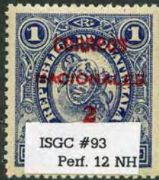
ISGC #93 Perf. 12 NH