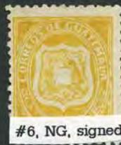
#6, NG, signed

1873. Sc. #5-6. ISGC #5-6. Regular Issue of 1873. Lithographed by Edward Matthews, London, in sheets of 100, probably 10 by 10. Design measures 18 3/4 by 22 3/4 mm, designed unknown. Rough line Perf. 11.7. Very soft white wove paper. Issued in 1873. 4f - 20,000 issued, 1p - 10,000 issued.