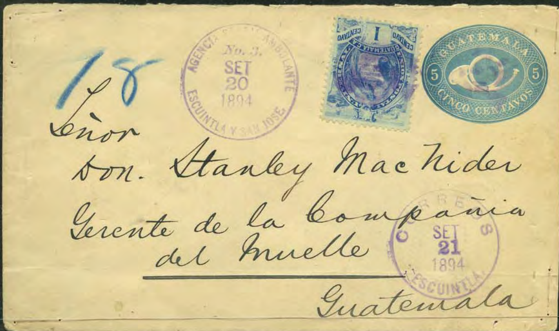
1894. Sc. #43, ISGC #45, EN16, F3. 5c Posthorn Envelope with 1x (Sc. #43) added 9.20.1894 with #3 Ambulante Escuintla y San Jose CDS, with "Recibida" back stamp.