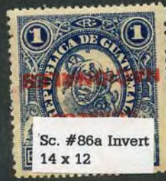
Sc. #86a Invert 14 x 12