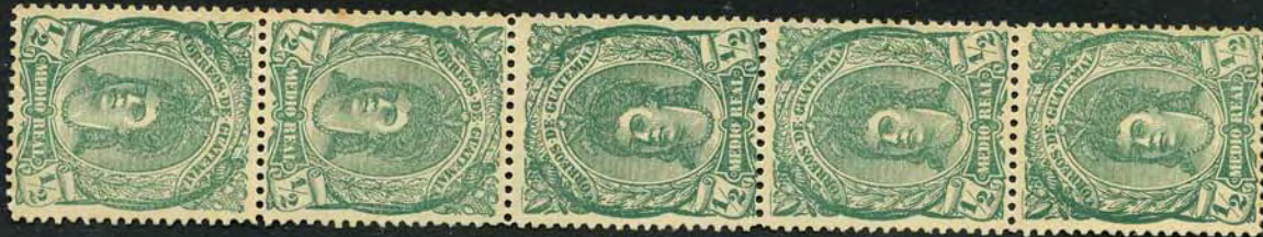
1878. Sc. #11, ISGC Rep 11. Unofficial reprint of the 1/2c Indian Woman, Vertical Strip of 5 with center stamp tete beche, NH.